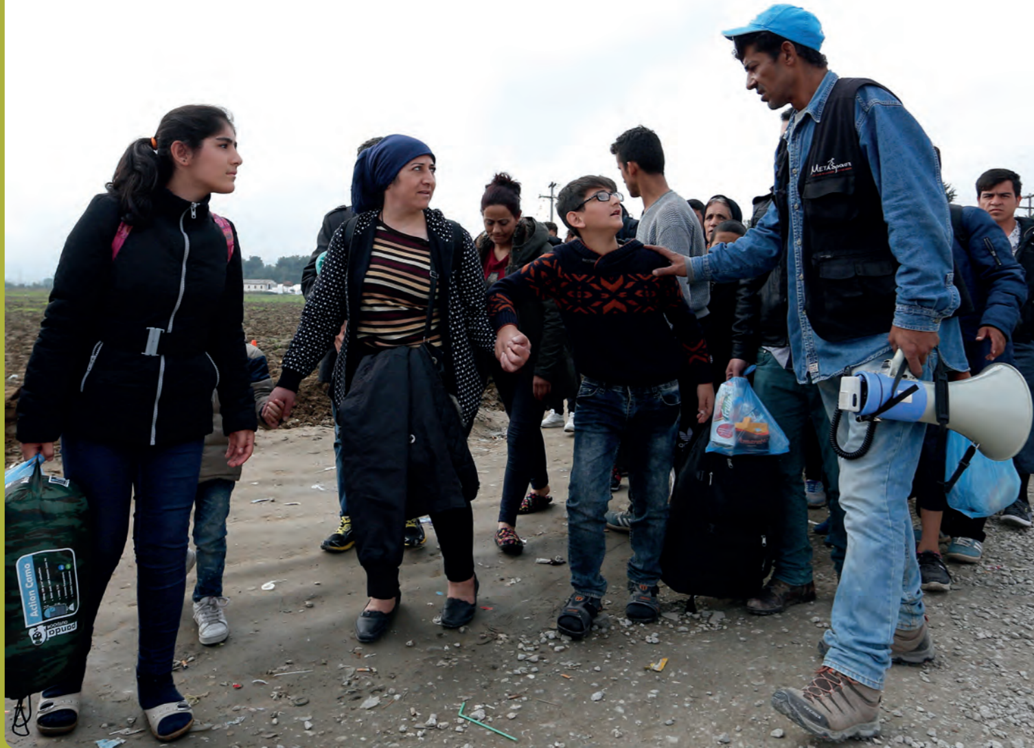
↑ Refugees are assisted by an interpreter as they arrive at a transit camp in Idomeni, Greece, on the border of Macedonia.

Africa Climate Mobility (n.d.). Africa Climate Mobility. https://africa.climate-mobility.org/