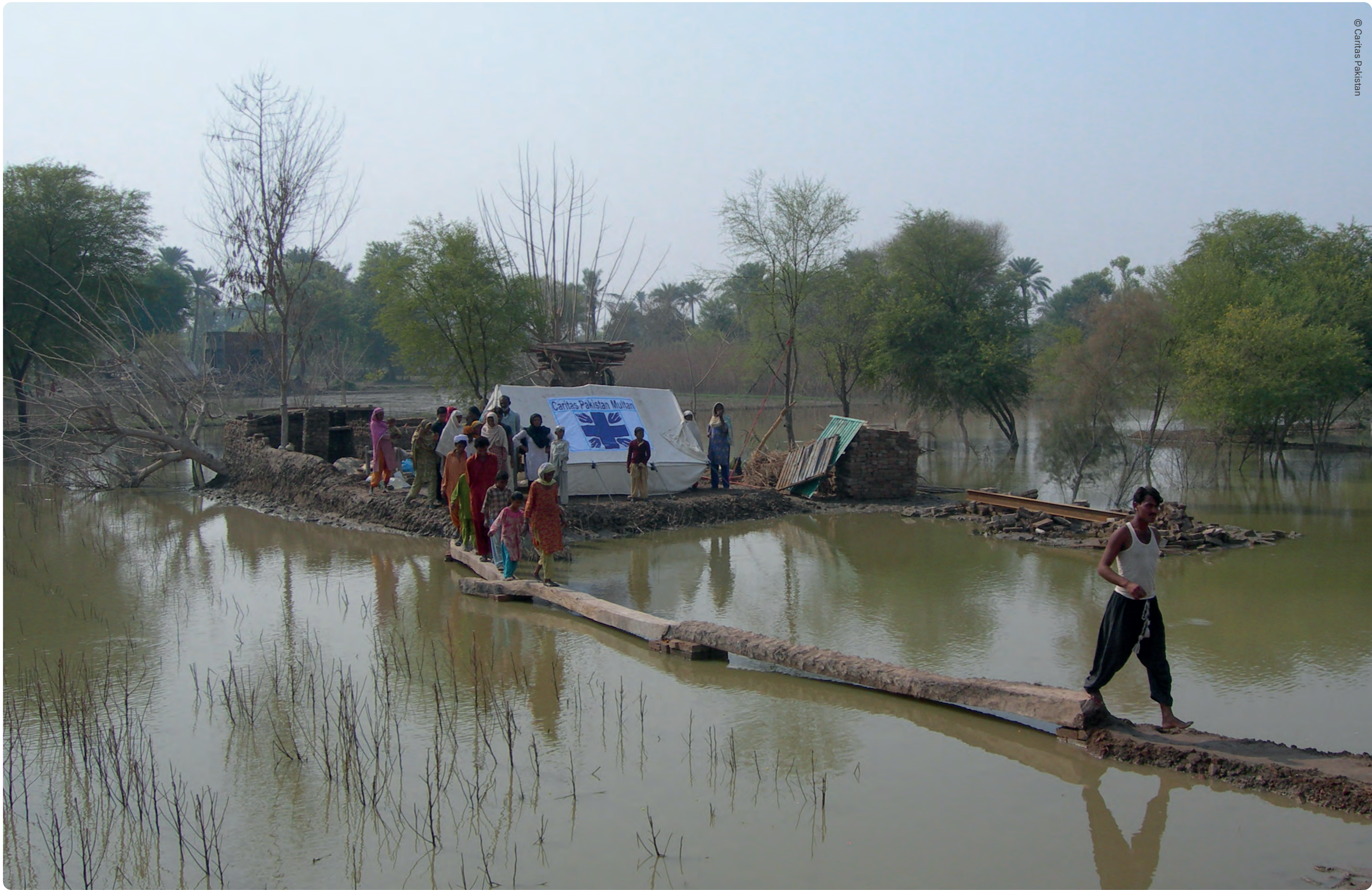
↑ Flooding in Pakistan.