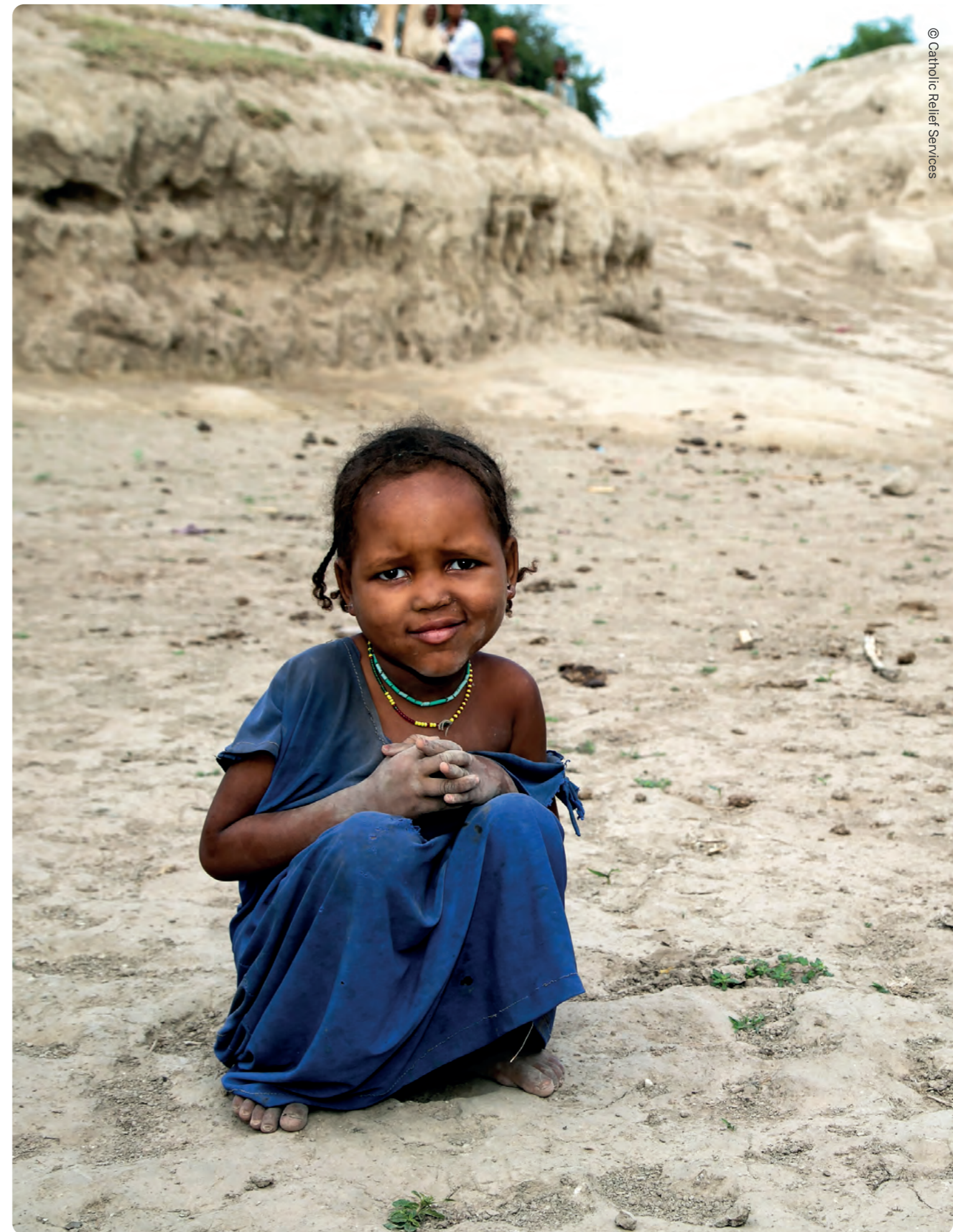
↑ Empty bottom of a basin that used to be a watering hole for a community of about 30 families: effects of the drought in Ethiopia.