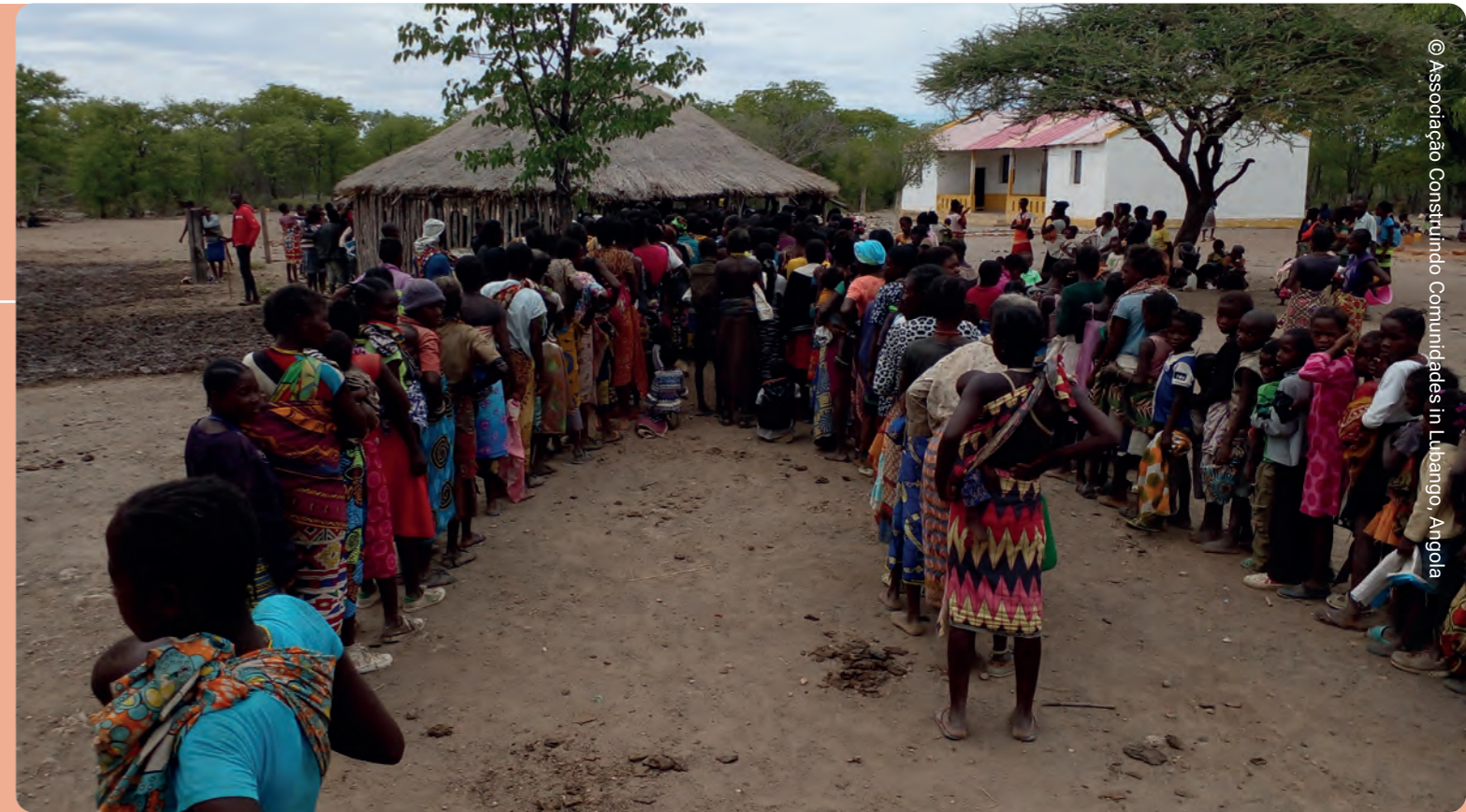
© Associação Construindo Comunidades in Lubango, Angola

Where climate displaced communities are temporarily housed, they have no access to education, literacy or any kind of training, worse even for unaccompanied minors. In addition, ethnic minorities in the south of Angola in general, have few vocational training opportunities. It is therefore extremely complicated for them to access the labour market when displaced.