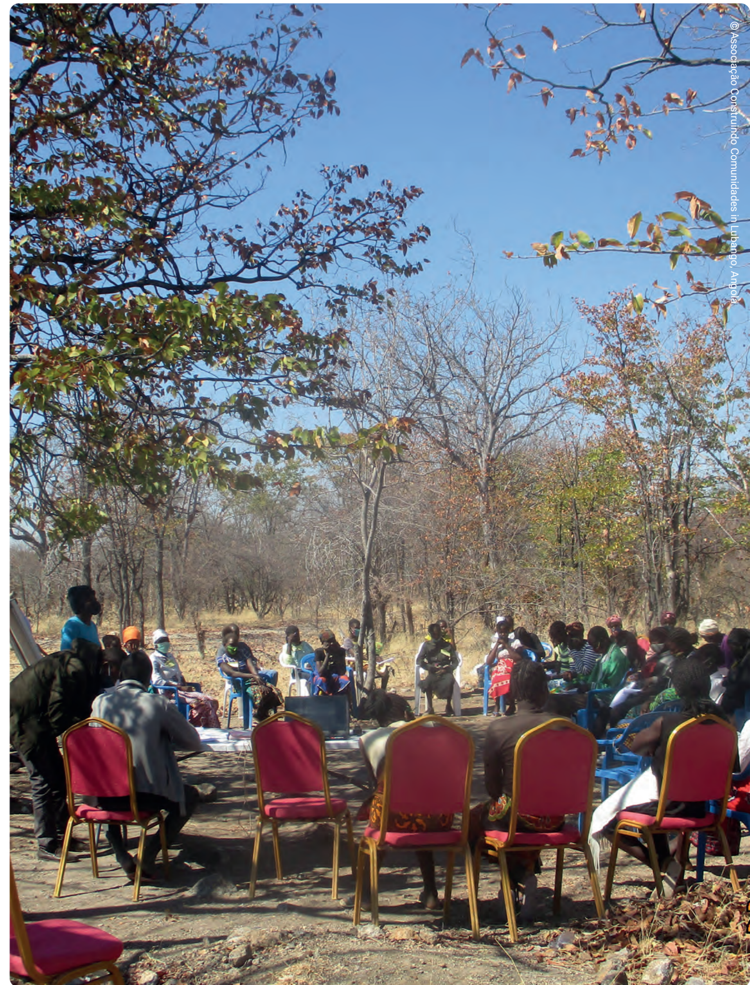
↑ Community focus group discussion facilitated by Associação Construindo Comunidades in Lubango, Angola.

Restorative justice can help communities to recover from their collective losses, material and immaterial. For example, to this day, a wound remains open in the hearts of the Angolan Herero community following a massacre that took place as far back as 1940. The descendants are demanding that the violence be acknowledged and that the sites of the massacres and graves be preserved. Communal harmony will not return until traditional ceremonies take place and until these minorities are recognised and protected.