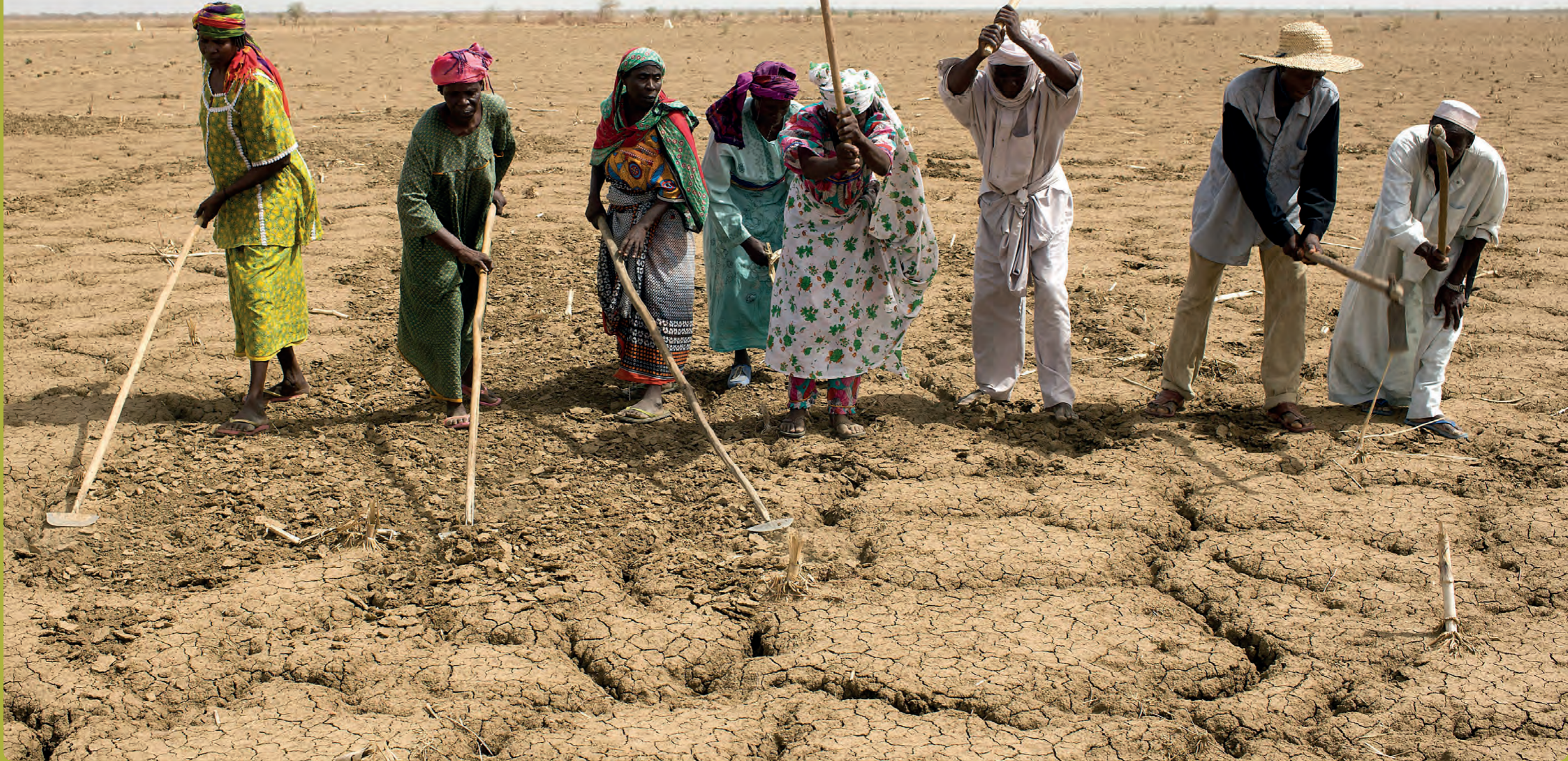
↑ The Sahel zone in Chad. A hard soil and lack of rain make it gruelling to till the field. The danger of famine seems imminent.