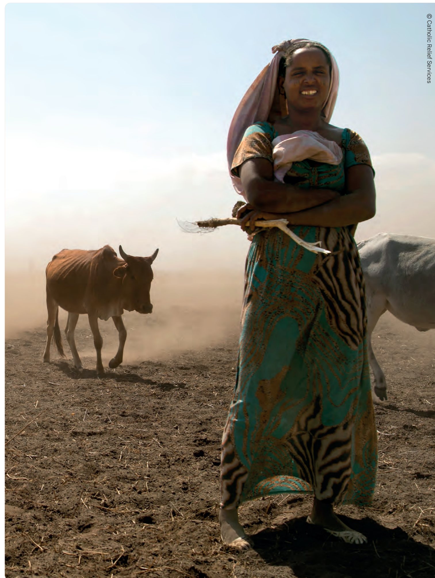
↑ Middle of Ethiopia's Rift Valley in Oromia where herders move long distances to search for water.

States must accept the reality that migration has become an adaptation response to climate change. They must take the necessary steps to enable and support proactive migration that is safe, regular and orderly to minimise losses and damages and associated human rights violations, as well as ensure reparation for losses and damages when they could not be avoided.