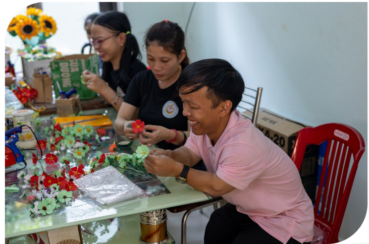
Lam and other I-SHINE program youth with a disability create and sell handmade flowers in Vietnam.

Discuss ways you can share your pilgrimage experiences with others at school or at home, being mindful that the experience might not be something students feel comfortable sharing.