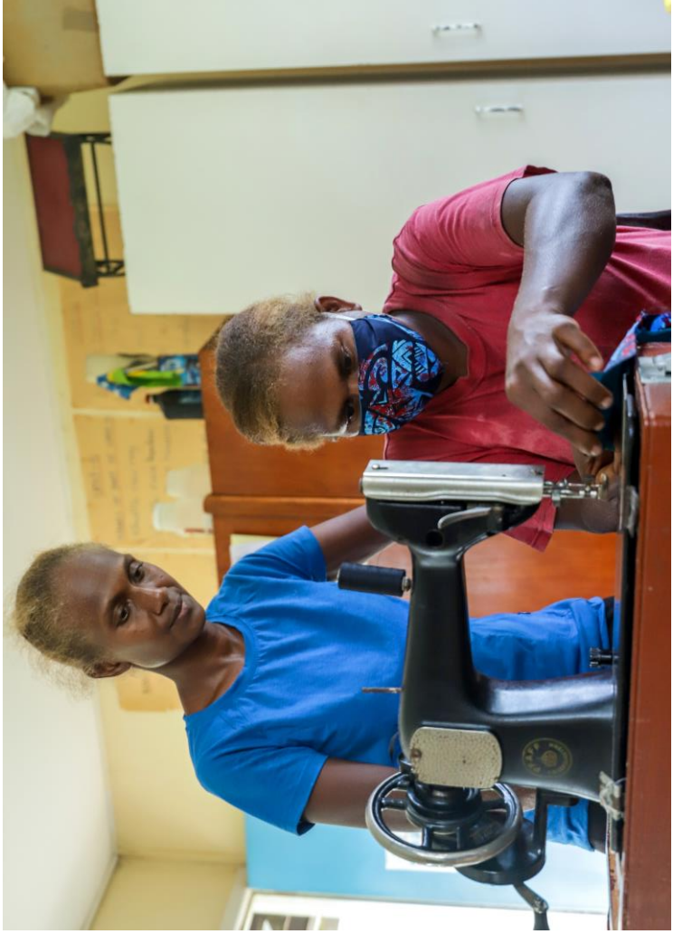
Caritas supplied fabric for students to sew face masks as part of the COVID-19 prevention measures at the San Isidro Care Centre in the Solomon Islands.