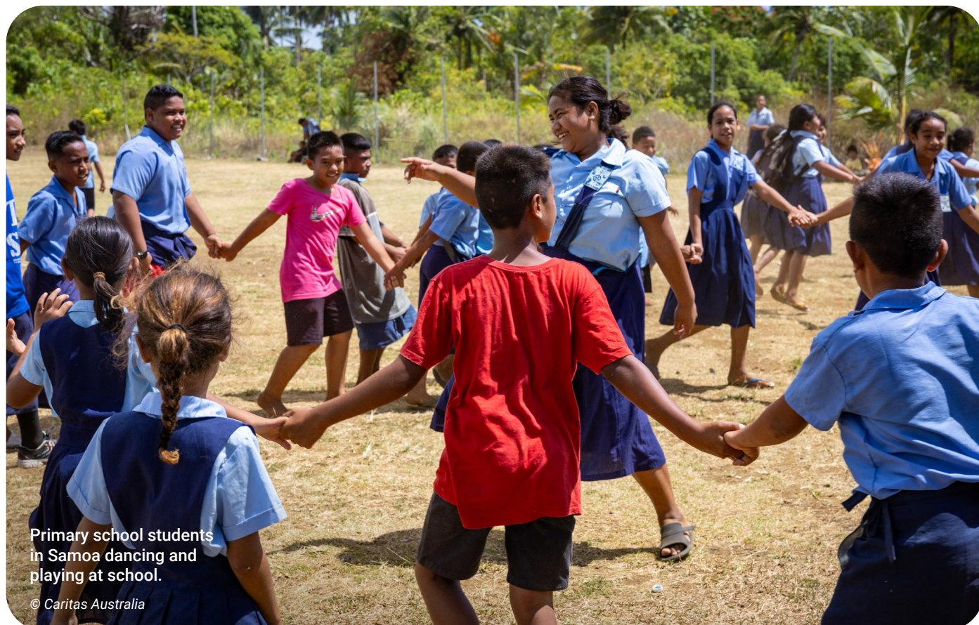
Primary school students in Samoa dancing and playing at school.

We pray for greater respect for the environment. May we care deeply for Earth, the place that God has entrusted to our care. May we celebrate the Year of Jubilee year as pilgrims of hope, ready to find the direction towards peace and justice that God wants for us. May we Unite Against Poverty as we grow in respect for all life.