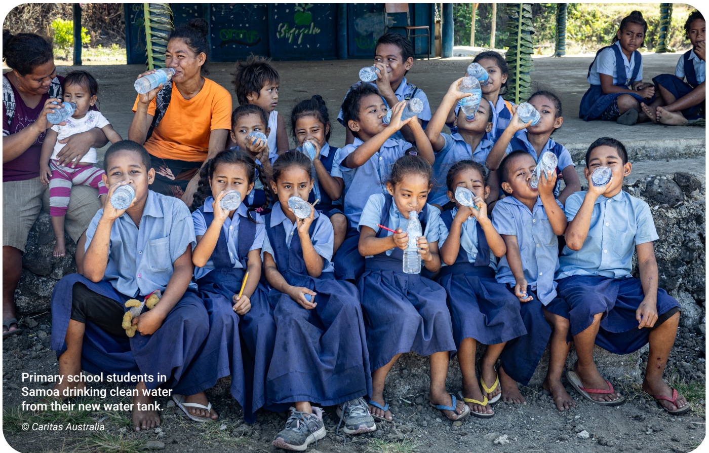
Primary school students in Samoa drinking clean water from their new water tank.