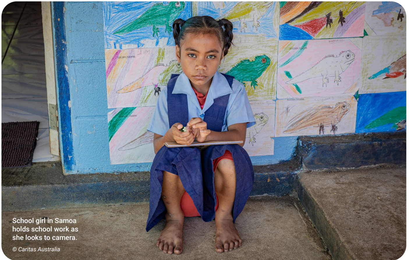
School girl in Samoa holds school work as she looks to camera.