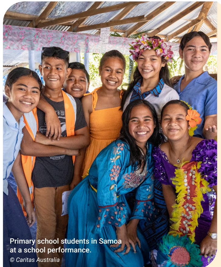
Primary school students in Samoa at a school performance.

Let us Unite Against Poverty as people of crystal-clear vision. Let us take to heart the words of St Paul, part of whose letter to the Corinthians we